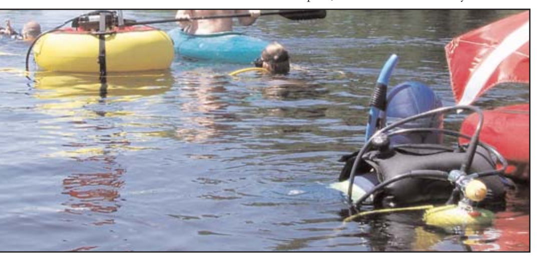
SCUBA divers, divers using a floating hookah system, and spotters in boats at a recent MCIAP training event.

Removing plants causes turbidity; so much of this hand work is done in conditions of poor visibility, compelling divers to learn to recognize the target invaders as much by feel as by sight. The visibility problem can be mitigated somewhat by working methodically in one direction, and striving to keep ahead of the leading edge of the sediment plume. Another solution is to work a defined area, or "plot," until the turbidity becomes