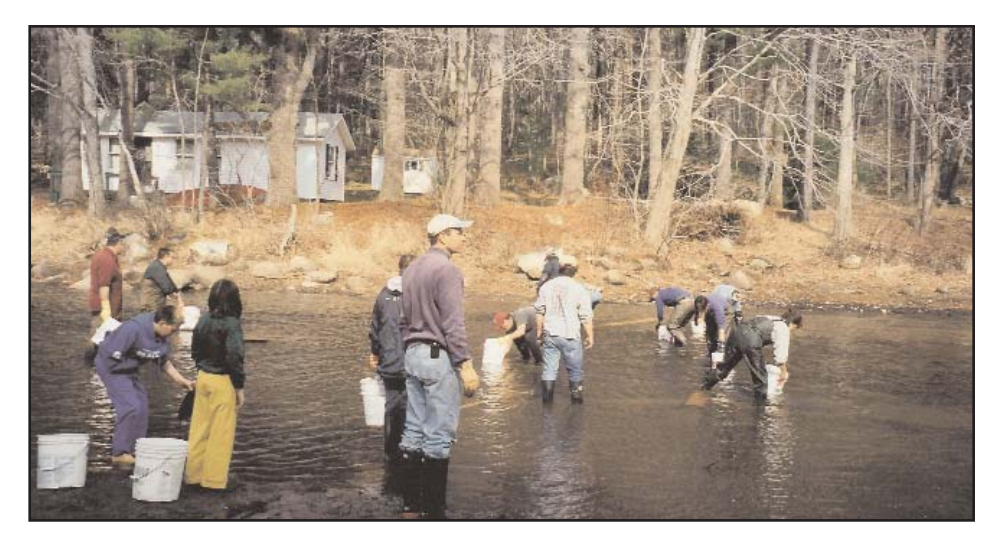
Volunteers wading into Dingley Brook, in Raymond, to remove variable milfoil.

Getting the octopus-like variable milfoil weeds into the bags can be a challenge. The upper parts of plants may be coaxed into the bag prior to digging in after its roots, to keep the plant under control and to minimize fragmentation. Larger plants are sometimes wrapped around the diver's hand like a forkful of spaghetti prior to bagging. It may be necessary to remove some plants in sections--removing the